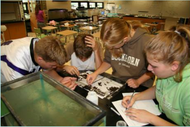
Students Sorting and Identifying Exuviae