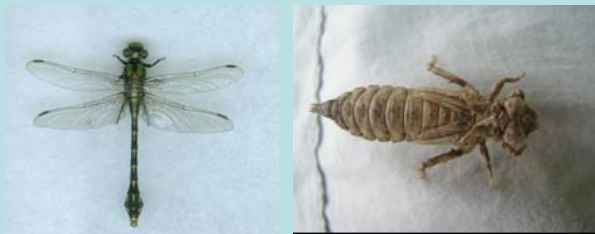
St. Croix Snaketail Adult and Exuviae

Students at Grantsburg High School and their instructor quantitatively sampled dragonfly (anisoptera) exuviae from 70 sites on the St. Croix and Namekagon Rivers. An additional 25 sites on six Wisconsin tributaries were also qualitatively sampled. Initial analysis of 16,157 exuviae resulted in 43 species identified. Four species ( Ophiogomphus rupinsulensis – 16.6%, Ophiogomphus howei – 12.7%, Gomphurus vastus – 10.6%, and Neurocordulia yamaskanensis – 10.1%) comprised 50% of the sample. Nasiaeschna pentacantha , a species not previously known to occur in Minnesota, was found at two separate sites. Ophiogomphus susbehcha and Ophiogomphus anomalus , Wisconsin endangered and Minnesota threatened species, made up 2.4 and 0.1% of the sample respectively. Susbehcha was found at 29 sites from Riverside Landing to Franconia with a maximum density of 1.48 exuviae/ft of shoreline. Anomalus was more northerly in distribution and rare throughout being found at only ten sites from the headwaters of the St. Croix and Namekagon to Fox Landing, and never reaching a density greater than 0.05 exuviae/ft of shoreline.