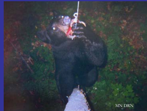
Bear Hitting a Bait