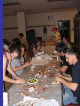
Preparing Bacon Baits

The results of the baiting effort were used to model black bear habitat in the state. We used an occupancy estimation modeling framework which allows for the calculation of detection probability. Detection probability is the probability that a bait will be hit if a bear is present. The detection probability of our baits was 0.63. We modeled the occupancy of each township in the state using landscape level covariates. The covariates included stream density, road density, housing density, forest cover, agricultural land use, and wetlands. A map of predicted bear occupancy is found below. This model will be used to predict future expansion of bears which will allow for proactive management.