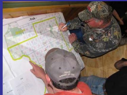
Volunteers Looking at Bait Maps